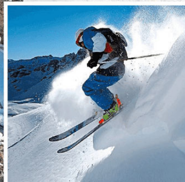
Slope style: Freeskiing in the French Alps