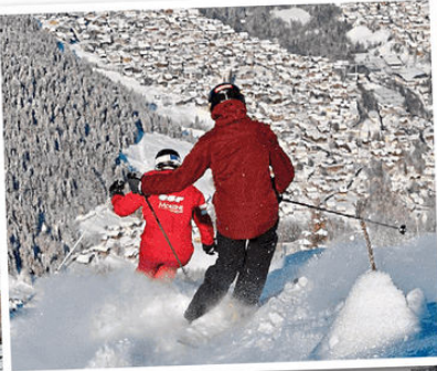
Award-winning: Morzine received the Flocon Vert for its approach to mountain tourism