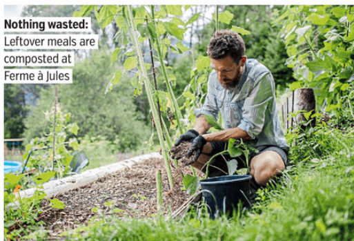
Nothing wasted: Leftover meals are composted at Ferme à Jules

'Using local produce is in their blood here. They wouldn't do anything else'