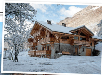
Carbon neutral: Ferme à Jules is a converted farmhouse